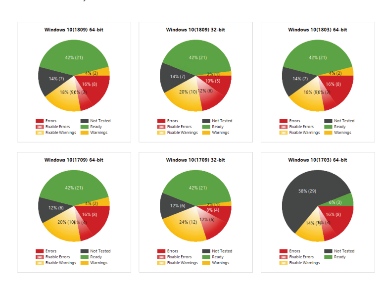
AdminStudio 2020 provides reporting for all supported versions of Windows 7, 8, 10 and Server

Compatibility testing and reporting are provided for all supported versions of Windows 10, as well as Windows 7, 8 and Server.